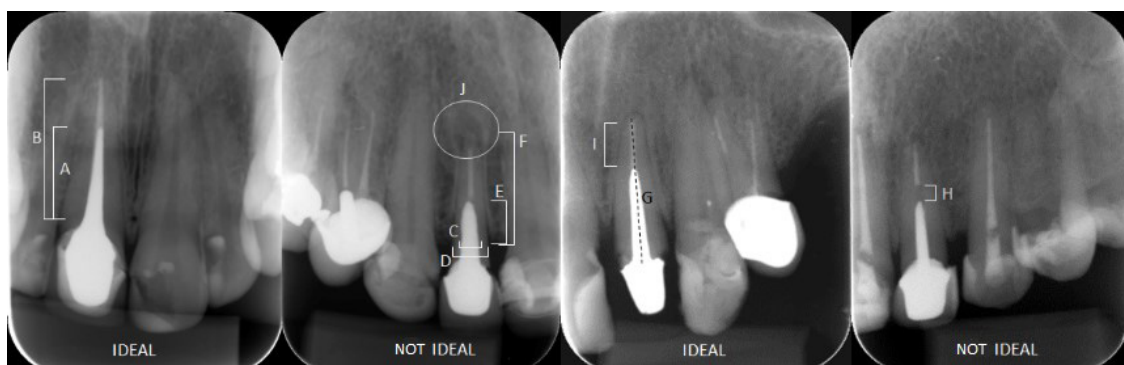
Figure 1. Measures obtained for each assessed tooth. A = 2/3 \times B (ideal post length); C = 1/3 \times D (ideal post diameter); E = 1/2 \times F (ideal post:bone crest ratio); G = post contiguous to root canal; H = presence of gap between the remaining root canal filling and post; I = ideal amount of remaining root canal filling: 4mm; J = absence of periapical lesion.

All radiographs containing endodontically treated teeth with cast metal posts and cores were expanded, and the measures were taken observing the absence or presence of failures according to the following prosthetic principles: length of post, diameter of post, ratio between post and bone crest, contiguity of post to root canal, gap between post and the remaining root canal filling, amount of remaining root canal filling, and absence of periapical lesion. The following prosthetic data were considered satisfactory: cast metal posts and cores with post length equal to 2/3 of root length (1mm error margin); post diameter equal to 1/3 of root diameter (0.5mm error margin); post:bone crest ratio with the post reaching 1/2 of root bony implantation; post contiguous to root canal with no deviations; absence of gap between post and the remaining root canal filling (0.2mm error margin); remaining root canal filling in the apical third of the tooth, with a minimum of 4mm of gutta percha (below 4mm was considered inadequate and above 4mm was considered adequate, as long as not combined with short posts); and absence of periapical lesion (Figure 1).