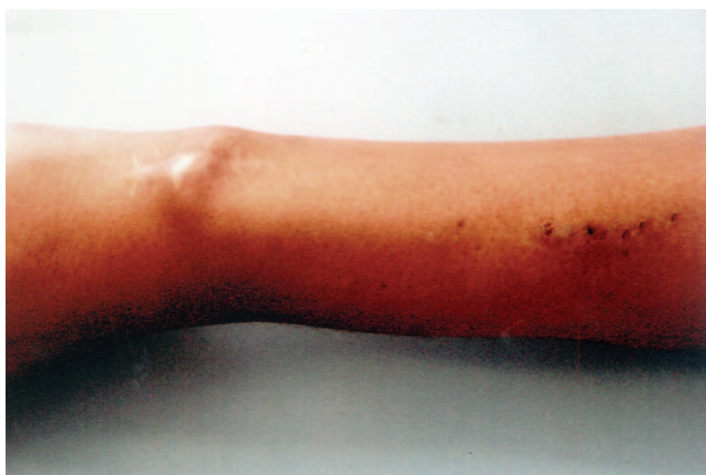
Figure 3 - Patent radiocephalic arteriovenous fistula in a girl weighing 15 kg.

All the AVFs could be used for hemodialysis, but they required an interval of 3 to 4 weeks after surgery before they were sufficiently developed. This delay corresponds to the period of fistula maturation and could be diminished by a program of regular hand exercise. During this period, a dou-