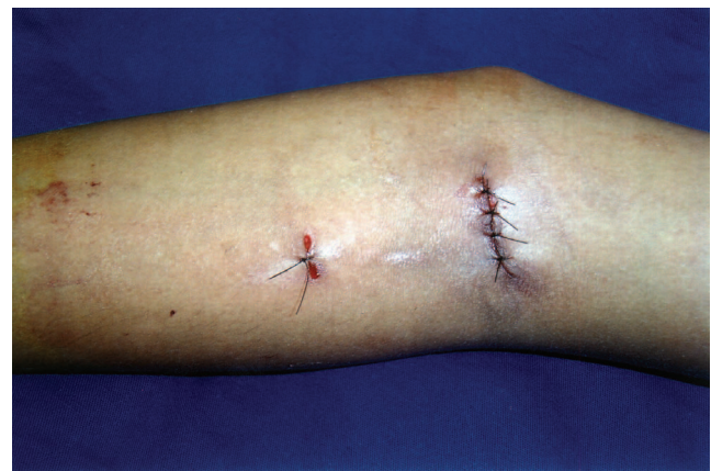
Figure 1 - Incisions used for the creation of brachiocephalic fistula.

In the patients in whom the cephalic vein at the forearm was not available, or in whom a previous radiocephalic fistula had failed, the second option was to create a fistula at the elbow. A 3-cm transverse incision across the antecubital fossa was made, and the basilica or cephalic vein was exposed, with special care to avoid damage to the medial cutaneous nerve of the arm. When the cephalic vein was utilized, a greater length of vein was obtained by performing another small incision at the lateral aspect of the forearm (Figure 1). After spatulating the terminal end of the vein, a side-to-end arteriovenous anastomosis was performed (Figure 2).