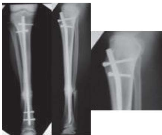
Figure 4 - Patient with healed fracture without evidence of nail extrusion but still suffering knee pain.

Knee pain is a common finding in the LIN method, with reported incidence rates varying from 20% to 70%. 2,9-11,27,41 Despite its frequency, the exact cause of this pain is unknown, but it appears that it is not related to the residual protrusion of the nail in the knee, 41 nor to the access path used, whether through the patellar tendon or medially. 11 Removal of the nail improves or eliminates the pain in most