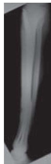
Figure 2 - Recurvation union in a fracture set with Ender pins. Note that the deformity coincides with the angle of the distal ends of the pins.

All patients studied recovered total knee and partial ankle mobility, without significant differences between the two groups. There was, however, a significant loss of subtalar mobility ( P = 0.04 ; Mann-Whitney test) in the patients treated with Ender pins. The number of patients with pain