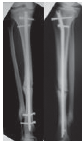
Figure 3 - Breakage of distal locking screws in an A2 type fracture, contributing to a significant shortening in the group treated with locked intramedullary nails.

In both groups, there was a larger number of young patients (average age 32.75 years), males (90.9%), and traffic accident victims (84.1%). These findings are in accordance with the majority of studies related to tibial diaphyseal fractures 1,4,19-28 and show the effect of a high level of