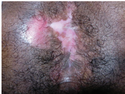
Figure 2 - Proctologic exam after surgery.

b114® for HSV type 1 and b116® for HSV type 2 from Dako Denmark A/S (Glostrup - Denmark) revealed the presence of HSV type 2. Fungal and acid-alcohol resistant bacilli screening were negative.