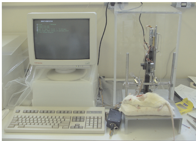
Figure 2 - NYU system

movement and 21 indicated normal movement. Four doctors were trained as observers and formed the study group that evaluated the animals on the BBB scale.