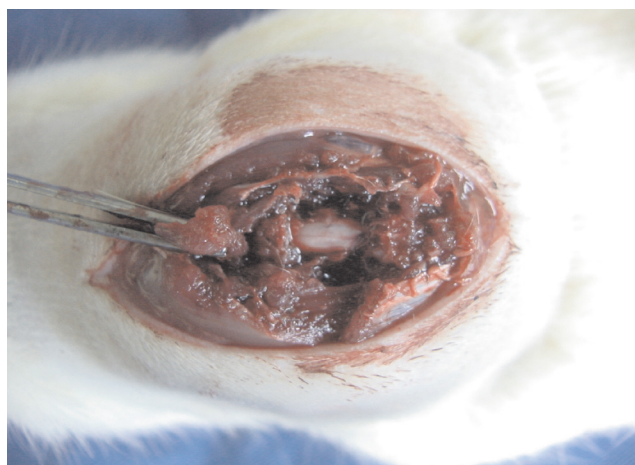
Figure 1 - Exposure of the dura mater following laminectomy

For the anesthesia procedure, pentobarbital was administered via the intraperitoneal route at a dose of 65 mg/kg. A skin incision of approximately 5 cm was made along the dorsal medial line. The paravertebral musculature was separated from the spinous processes to expose the vertebral column from T8 to T12. Then, with an appropriate punch, laminectomy was performed in the distal half of T9 and T10, without causing injury to the dural sac, thereby allowing enough space to accommodate the impactor head (Figure 1).