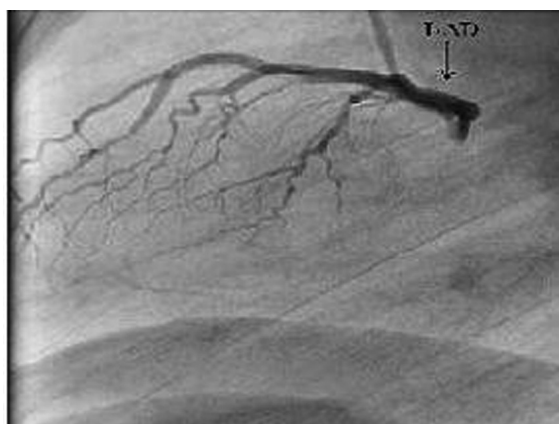
Figure 2 - Coronary angiography from the left lateral view, not showing the circumflex artery.