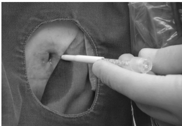
Figure 2 - Fibrin glue applicator being placed through the catheter

fluoroscopic guidance. A 6.5-F catheter was advanced over the wire to the level of the kidney sheath, and a flexible fibrin glue applicator was placed through the catheter (figure 2). Approximately 5 ml of fibrin glue was injected throughout the fistula tract as the catheter was slowly withdrawn. A control fluoroscopic image was obtained (Figure 3), revealing the absence of further communication between the renal sheath and the skin. On the first postoperative day, no urinary leakage was observed; at a four-week follow-up, the patient was asymptomatic with unremarkable findings at clinical examination. At this time, the double-J catheter was withdrawn, and no urinary leakage was seen after that.