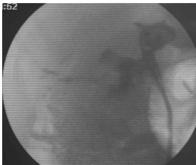
Figure 3B - Fluoroscopic image 5 minutes after fibrin glue application

nephrocolic communication, including urinary drainage with the indwelling double-J stent and removal of the nephrostomy tube from the pelvicalical system. Conservative treatment is usually successful in patients with early-diagnosed retroperitoneal colonic injury; however, late diagnosis can result in colostomy. This observation highlights the importance of early diagnosis and treatment of colonic injury prior to the establishment of colocutaneous fistula. 4