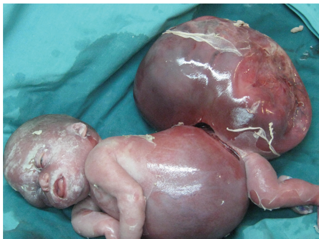
Figure 1 - A view of the huge SCT and the fetus showing hydrops fetalis.

pain in the right iliac fossa and pyrexia (38°C). An abdominal examination revealed right lower quadrant tenderness that radiated to the ipsilateral flank, rebound tenderness, and right lumbar pain. The patient's white blood cell count was 1100/ \mu l, and a blood coagulation profile showed an activated partial thromboplastin time of 37 s (normal value: 25-40), a derived fibrinogen level of 445 mg/dl (normal value: 200-450), and a D-dimer level of 865 \mu /mm 3 (normal value: 0-200). An abdominal computed tomographic image exhibited extrinsic compression of the ureter by a hypodense filling defect within the right ovarian vein, which is characteristic of ovarian vein thrombosis and grade III-IV hydronephrosis (Figures 2, 3, and 4). Thus, the patient was treated with a low-molecular weight heparin coagulant (nadroparin 3800 IU, 0.6 ml every 12 h). Three days after the beginning of this therapy, color Doppler ultrasonography revealed a good vascular flow in right ovary, recanalization of the ovarian vein, and a reduction in the amount of fluid in the abdomen. At this point in time, the