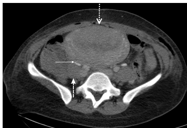
Figure 4 - Grade III-IV hydronephrosis (thick dashed arrow) and ureter obstruction (thin solid arrow).

ureter was still dilated by extrinsic compression; however, a week later, ultrasonography showed normal-size ureter. The patient's coagulation profile was within normal ranges in the following days.