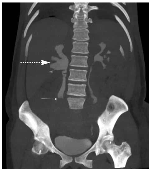
Figure 3 - A computed tomographic image that depicts the obstruction of the right ureter (thin arrow) by the enlarged right ovarian vein (thick dashed arrow).