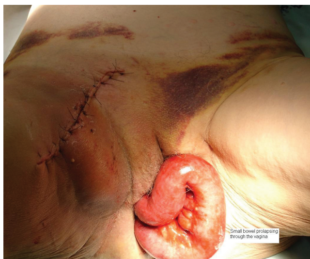
Figure 2 - The pelvic examination revealed that the small bowel was edematous and thick-walled, but still viable. The inguinal hematoma was drained for a second time, specifically at the time of the prolapse surgery, because it looked infected.

Vaginal evisceration is a rare event that has been reported to occur after vaginal traumas induced by coitus, obstetric instrumentation, and the insertion of foreign