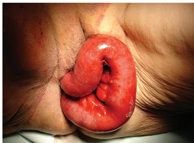
Figure 1 - Pelvic examination revealing the small bowel prolapsing through the vagina.

Upon admission to the emergency room, the patient's blood pressure was 110 x 70 mmHg, her heart rate was 88 bpm, and an abdominal examination indicated significant pain. The pelvic examination revealed 40 cm of small bowel prolapsing through her vagina (Figure 1). After resuscitation of the patient, she received intravenous broad-spectrum antibiotics (1 g of Ceftriaxon and 500 mg of Metronidazole),