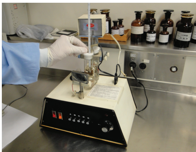
Figure 1 - Fusion point tests of Oseltamivir phosphate.

In the current study, excellent stability was demonstrated for at least 21 days at room temperature, with no detection