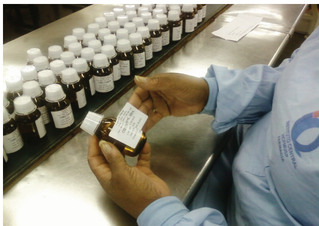
Figure 4 - Final inspection and labeling.

control the outbreak of the swine flu. The European Society of Intensive Care Medicine established a task force and issued a special supplement of its journal, defining recommendations and standard operating procedures for dealing with the pandemic, which had the potential to progress to a massive disaster. 17,18