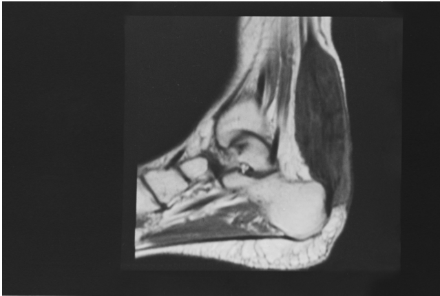
Figure 2 - Ankle MRI sagittal section in T1 showing Xanthoma of the Achilles in a patient with CTX.

several tissues and the absence of CDCA in the bile. These symptoms were determined to be the result of a disorder of hepatic conversion of cholesterol to cholic acid and CDCA. 3 In 1975, Salen et al. reported that administration of CDCA dramatically reduced cholestanol synthesis in CTX patients. 4 In 1984, Berginer et al. demonstrated that one year of CDCA oral supplementation treatment at 750 mg/day was sufficient to produce a significant improvement in neurological symptoms, normalization of EEG readings, and a reduction in serum cholestanol in CTX patients. 5 In 1991, Cali et al. identified a defect in the gene encoding the 27-hydroxylase enzyme in CTX patients. 6 More than fifty different mutations of this gene have since been reported worldwide, and molecular analysis has enabled diagnosis during the pre-symptomatic period. 7