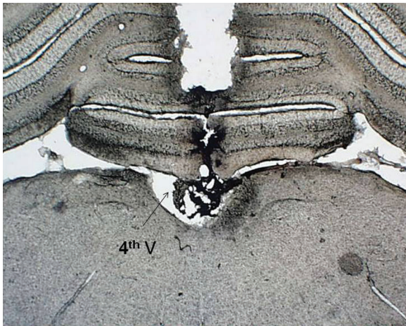
Figure 1 - Histological image of a rat brain coronal slice showing the medulla and cerebellum (~13 mm caudal to bregma). V4: fourth cerebral ventricle.

alteration is not higher than the difference between vehicle and ATZ groups at 60 minutes: ATZ 106(113–119 mmHg or 5.0%) vs vehicle (101–106 mmHg or 5.1%) groups.