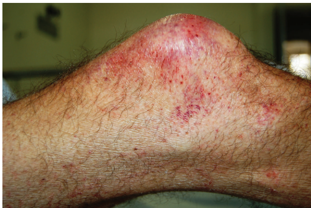
Figure 1 - Ecchymosis, perifollicular hemorrhage, and corkscrew hairs in the right knee.

Although full-blown vitamin C deficiency is currently uncommon, sporadic cases of scurvy have been described, mainly among psychiatric, alcoholic, and HIV-AIDS patients or in children with bizarre food-intake habits (4,5,8). Although low ascorbic acid levels in leukocytes (a measure of tissue stores) are common in patients with alcoholic cirrhosis (9), this is the first reported case of scurvy in an alcoholic, malnourished man with cirrhosis and spontaneous bacterial peritonitis.