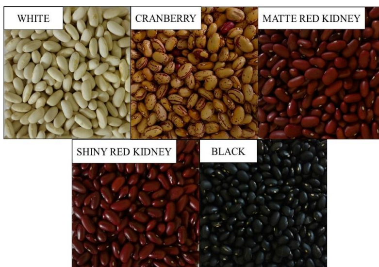
Figure 1. Representative image of the five samples of the bean colours evaluated.

The evaluation of the technological and nutritional quality traits of common beans was carried out in a completely randomized design with three replications. The bean colours were determined by a portable colorimeter, using the Cielab numerical system. On this scale, L represents the grain's luminosity, which ranges from 0 (black) to 100 (white); a* values range from -60 (dark green) to +60 (dark red); and b* can range from -60 (dark blue) to +60 (dark yellow). Fifty-gram samples of grains were evenly distributed on a petri dish, completely covering the bottom of the container. The petri dish was placed on a white paper, so as not to absorb other possible colours from the environment. The measurement head of the colorimeter was vertically placed on the beans, and three readings were made for each replication.