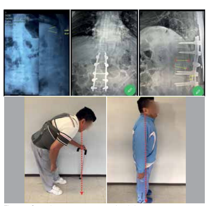
Figure 3. Corrective osteotomy. 2 years of evolution.

SPO (Smith-Petersen osteotomy; PSO (pedicle subtraction osteotomy; VCR (vertebrectomy).