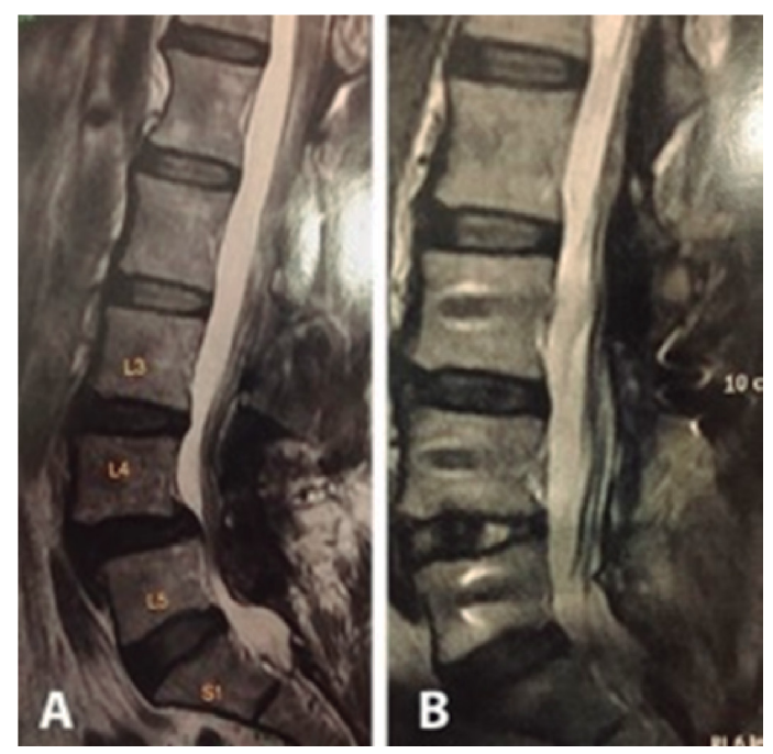
Figure 1. One of the cases that evolved with refractory meralgia paresthetica after L3-L4-L5 lumbar spine arthrodesis with L4-L5 TLIF. A – preoperative magnetic resonance examination. B – postoperative control examination.

Another aspect analyzed that has not been emphasized in the literature is the type of support used for the prone position. We observed that pneumatic support (automobile tire inner tube) was