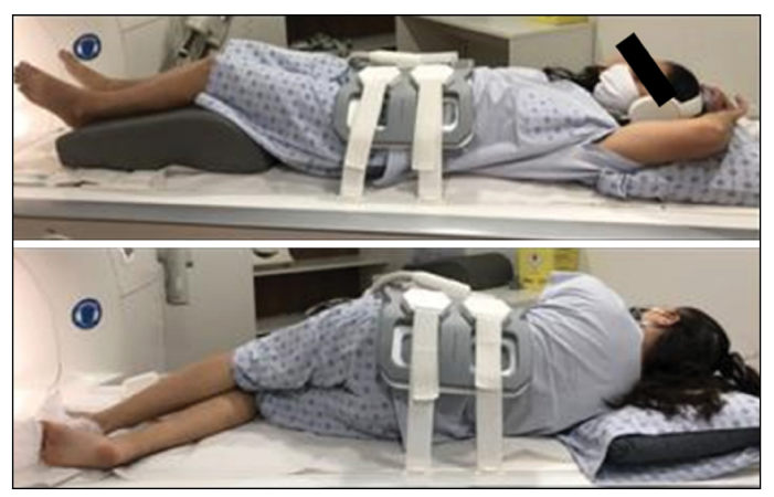
Figure 1. Photos showing the positioning of patients in the magnetic resonance equipment in dorsal and lateral decubitus.

Two independent evaluators performed the measurements using the RadiAnt DICOM software (Pozán, Poland). To assist in the measurements, the evaluators received a guide containing details on how to take the measurements. The observers were blind to the positioning of the patients. A reference line centered on the spinous process was used for inclusion of vertebral rotation in the different measurements. Another line tangent to the edge of the vertebra and parallel to the first was also used (Figure 2). The measurements were taken from axial slices in the center of the disc whenever possible.