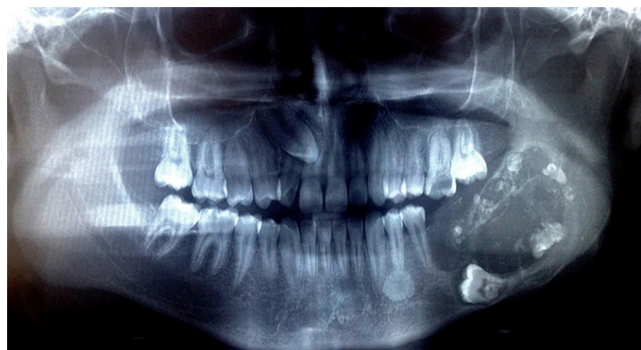
Figure 2 Panoramic radiograph showing multilocular extensive radiolucent lesion with radiopaque foci in the left mandible, associated with impacted molar (36).

An incisional biopsy was performed and submitted to histopathological exam. Microscopic examination of the sections routinely stained in hematoxylin and eosin revealed a biphasic neoplastic proliferation of odontogenic epithelial and mesenchymal tissue. The odontogenic epithelial component consisted of multiple cords and islands bounded by