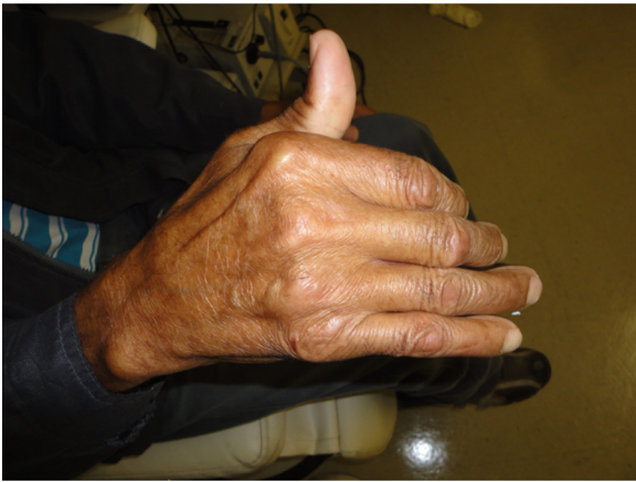
Figure 3 Claw hand.

The patient was treated with speech therapy for deglutition, and botulinum toxin was applied in his salivary glands to reduce saliva production.