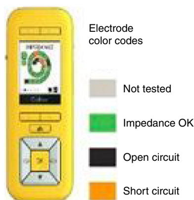
Figure 2 Information available for the remote assistant after evaluating the impedance and information on the electrode status.

the 3690 records, 99.4% (3674 records) showed impedance values within the normal limits. Regarding the 16 records considered to be abnormal, 9 electrode SC records were obtained, as they showed impedance values below the normal range.