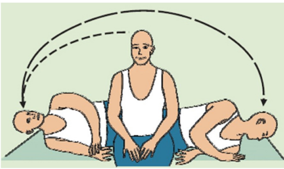
Fig. 2 Semont releasing maneuver towards the left for the treatment of right posterior canal cupulolithiasis. 26

beginning to the end of the trajectory, the head is kept in the same position until it reaches the opposite side, when the patient touches the stretcher with their forehead and the nose (Fig. 2). In the case of the superior canals, the movement is performed in the opposite direction to that used for the maneuver of the posterior canals.