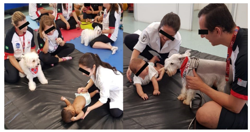
Figure 3. Dog Group Activity 2

The second session sought to stimulate the crawling and roll over movements, using the dog as the motivator for the movements (Figure 3). The animal was in front of the infant and the therapist offered help with motor stimulation.