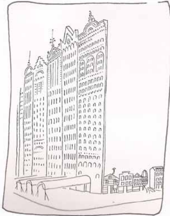
Chicago, Steinberg 1952

value.” Analyzing the disputes surrounding these urban districts, the authors show “a variety of mythographs, images and narratives [...] that each city chooses to adorn.” Adopting much the same approach, Castro (1999) shows us, through the transformation of cartographic representations of Rio de Janeiro, different forms in which the tourist experiences the city, constructed from “narratives and images that very often clash and vie with each other,” as if in distinct “provinces of meaning,” in Alfred Schutz’s terms.