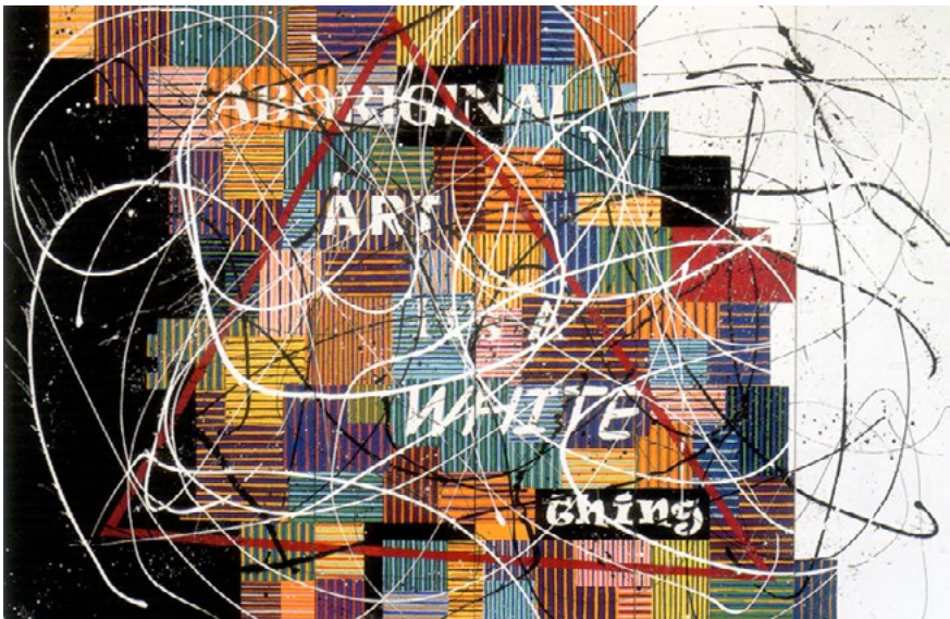
Figure 2. ‘Scientia e Metaphysica (Bell’s Theorem) or Aboriginal art is a white thing.’ Richard Bell, 2003. Acrylic on canvas. Museum and Art Gallery of the Northern Territory.

Moreover Indigenous art has become an arena in which forms of individual and collective emancipation can be experienced and political positions expressed. Eloquent examples include the bark petition typed and then elaborately painted by Yolngu leaders in 1963 in protest against the installation of a mining company in the northeast of Arnhem Land (Morphy 2008); the baticks made by the women of Utopia between 1976 and 1978 to prove that their community was economically viable and capable of surviving autonomously when they received the right to land (which came in 1979); or the irony of the urban artist Richard Bell, who won the Telstra Award, Australia’s most important prize for Indigenous art, with a painting sarcastically entitled ‘Aboriginal art is a white thing’ (2003).