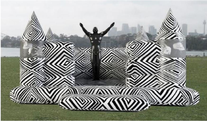
Figure 5. 'Jumping Castle War Memorial.' Brook Andrews, 2010. Installation for the 17th Sydney Biennial. Publicity photo.

Figure 5, above, shows an installation by an artist living in Melbourne, who is also a university professor and editor. Produced especially for the 17 th Sydney Biennale, it involved an inflatable castle, an allusion to the aristocratic European monuments, decorated though with designs from the Wiradjuri – the artist's ethnic group.