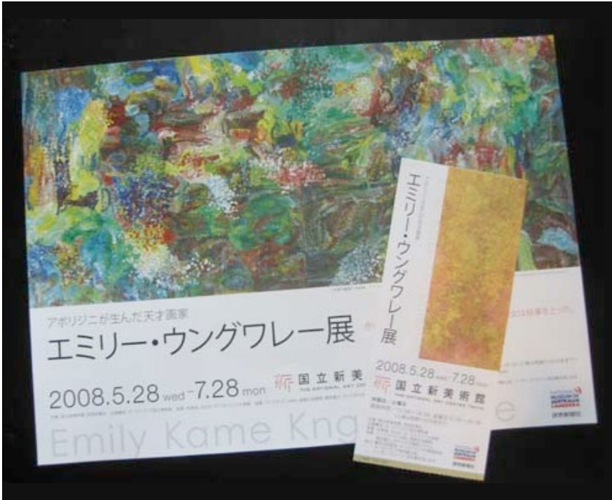
Figure 1. Poster and folder for Emily Kngwarreye's show in Japan. Publicity photo.

included in its edifice. The commission responsible for curating this project also included two professionals of Aboriginal descent, Hetti Perkins and Brenda Croft (Australia Council for the Arts 2006). In 2008 an individual show by Emily Kngwarreye, organized by Margo Neale, an Aboriginal curator, attracted large crowds in Osaka and Tokyo.