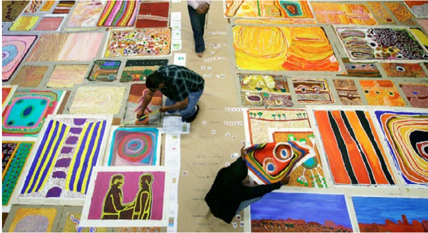
Figure 6. Curators preparing the exhibition for the 'Canning Stock Route Project.' Photo by Ross Swanborough, 2008.

and translators were hired to help with logistical, geographic and cultural issues. Aboriginal apprentices in photography and video documented the entire process under the supervision of experienced professionals. Well-known Aboriginal artists were invited to run workshops with the painting apprentices who took part in the project. Nine art centres and an anthropologist were also involved (Webster 2009). Together with the National Museum of Australia, the sponsors were the Aboriginal Lands Trust of the Federal Government, an aluminium and bauxite company, and the Western Australia State Lottery. The museum bought the 100 pictures produced during the project and produced an exhibition, which later travelled from Canberra to Beijing.