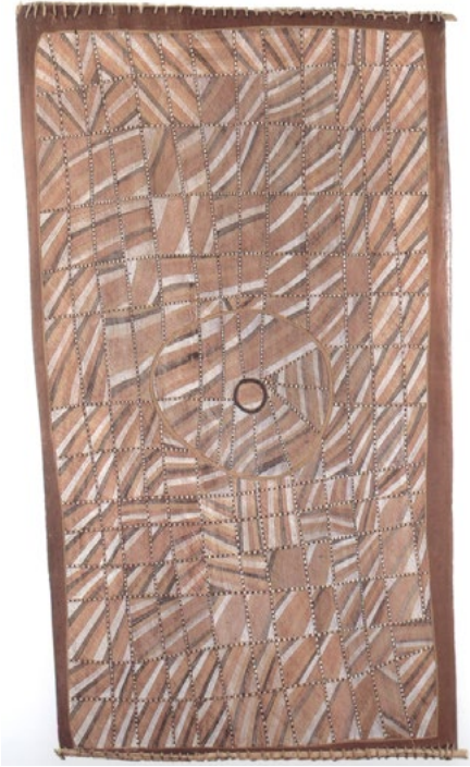
Figure 3a. John Murwurdjul. 'Mardayin - theme 1,' 1997. Natural pigment on tree bark. Annandale Galleries.