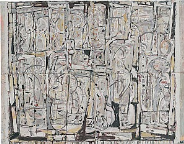
Figure 3b. Ian Fairweather. 'Monastery,' 1961. Acrylic paint and gouache on card and wood. National Gallery of Australia collection.