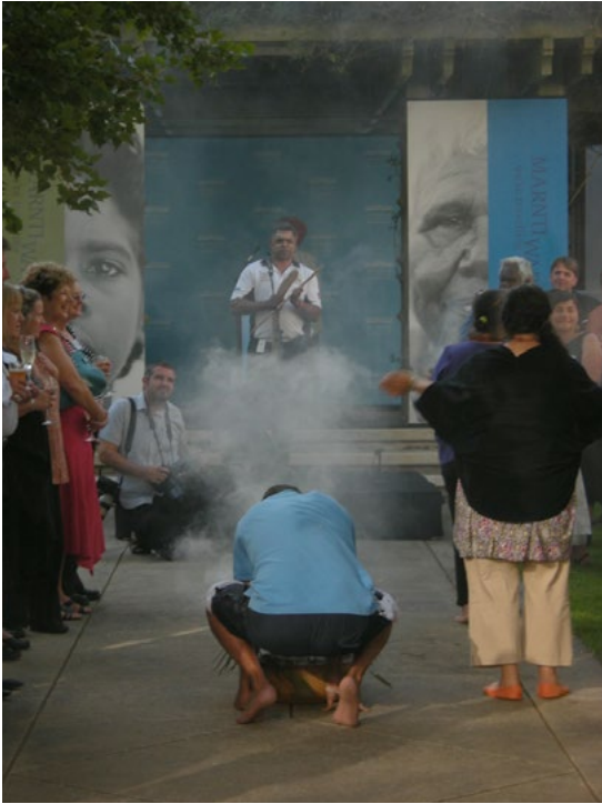
Figure 4. Smoking ceremony in the opening of the exhibition 'Marnti Waranjanga: we are travelling,' at the Museum of Australian Democracy, in Canberra. Photo: Ilana Goldstein, 2010.

In addition, smoking ceremonies (Fig. 4) were held at the exhibition openings which I attended at various institutions. 9 Green leaves chosen by the host group – responsible for the local Dreamings – are burnt, the smoke covers those present to purify and strengthen their bodies, also clearing the negative energies from the place. At the end the reasons for the smoking may be mentioned, and then the ceremony is usually closed with songs and percussion (produced by beating boomerangs and clapsticks).