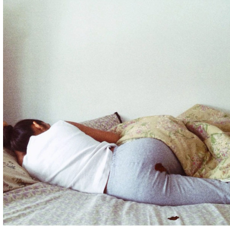
Rupi Kaur – Period (2016)

According to her website, the purpose of this photo series was to "challenge a taboo", to tell a story about menstruation without the use of words: