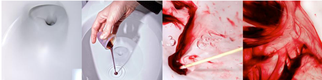
Beauty in blood (Lewis 2016)

Her description reveals the menstrual cup as central to the body techniques involved in the creative process, and the plastic experience of removing it and watching the 'beauty' of blood mixing and diluting in the water of the toilet bowl.