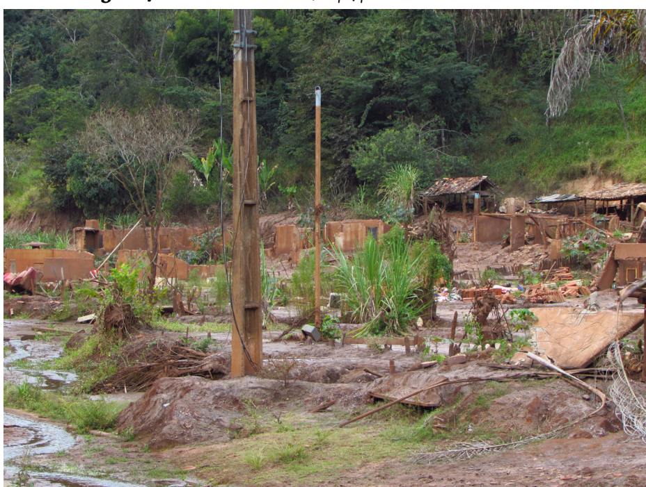
Figure 4 - Debris of Paracatu, 22/07/2016.