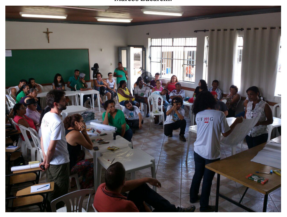
Figure 3 – Researchers from GESTA-UFMG work in collaboration with affected people from Paracatu on a map of the community destroyed by the disaster, 19/02/2017.