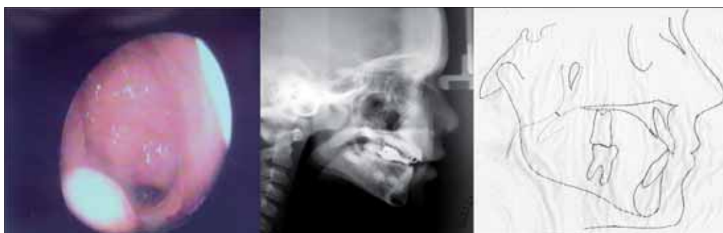
Figure 4. Grade 4 hyperplasia of the pharyngeal tonsils by nasofibropharyngoscopy and cephalometry (cephalometric analysis)