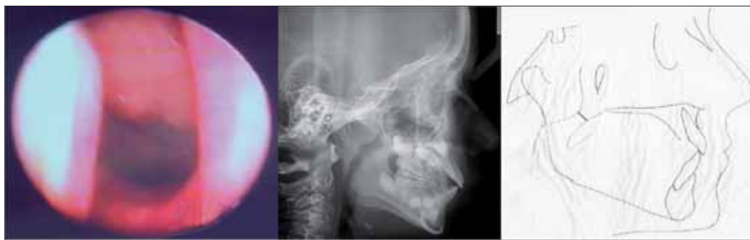
Figure 3. Grade 3 hyperplasia of the pharyngeal tonsils by nasofibropharyngoscopy and cephalometry (cephalometric analysis).