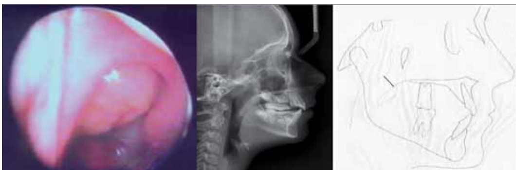
Figure 2. Grade 2 hyperplasia of the pharyngeal tonsils by nasofibropharyngoscopy and cephalometry (cephalometric analysis).