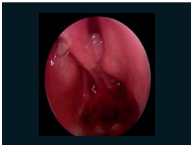
Figure 4. Nasal perforation of septo (2).