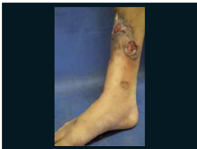
Figure 6. Ulcer of right leg.

In the laboratory examinations, did not evidence systemic illness associate. Anti-HTLV1 and 2 negatives; Ac anti DNA, anti - RNP, C3, C4, FAN, Anti-Ro, Anti-cardiolipin IgM and IgG, PCR and FR inside of the normal values; PPD: 4mm. Swab of ulcerated injury of skin became, having as resulted S. Aureus . Biopsy of skin of the face, being suggestive of Pyoderma Gangrenosum and of fragment of mucous of hard palate: ulcerated chronic inflammatory process with necrosis.