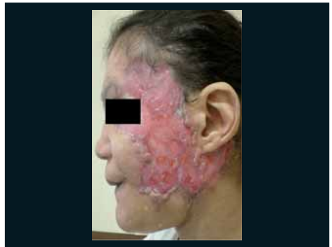
Figure 2. Face ulcer after treatment.