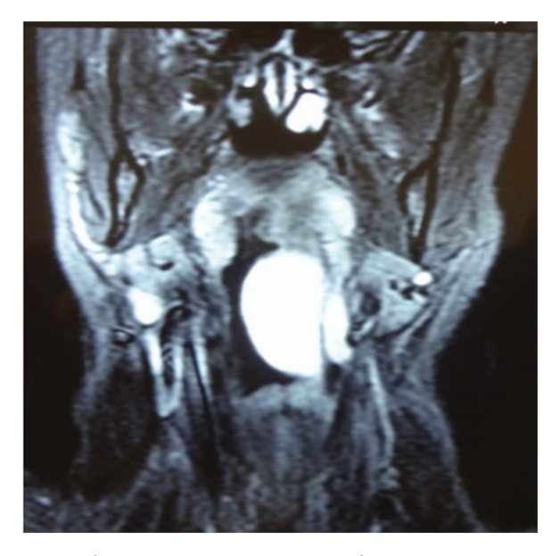
Fig. 3 Nuclear magnetic resonance, coronal view.