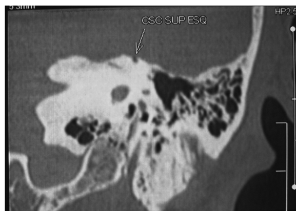
Fig. 3 Left superior semicircular canal dehiscence as seen on coronal temporal bone computed tomography.