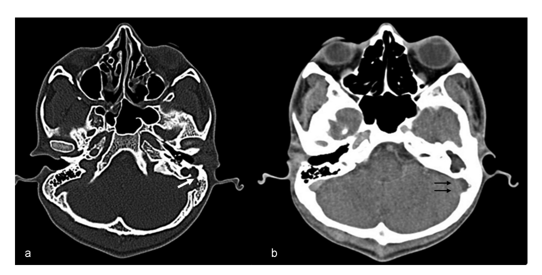
Fig. 1 (A) Computed tomography (CT) brain bone window axial cut showing the density of the soft tissue in the middle ear with a breach of the sigmoid plate (arrow) with cavitation of the mastoid air cell system. (B) Post-contrast CT brain soft tissue window axial cut showing central non-enhancement of the clot in the sigmoid sinus observed in the left side, with surrounding enhancing bone and dural sinus wall (double arrow) showing the classic 'empty delta sign' in sigmoid sinus thrombosis.

All patients recovered satisfactorily, with complete resolution of their symptoms and complications with the control of the middle ear infection. The mortality rate was of 0%. The average length of the follow-up was 16 months (range: