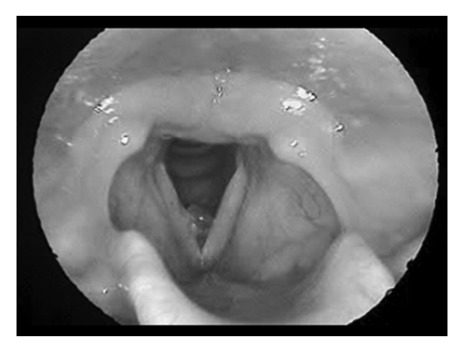
Fig. 1 Angiomatous polyp in the right vocal fold.