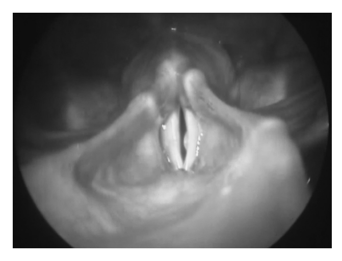
Fig. 2 Gelatinous polyp in the left vocal fold.

In this respect, the aim of the present study was to analyze the existing literature on vocal fold polyps published in the last 16 years.