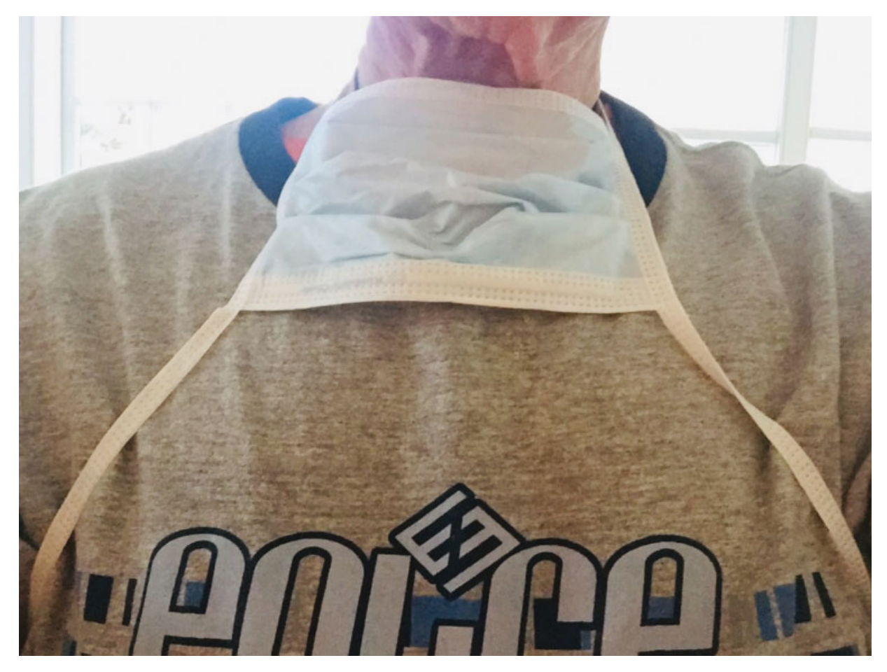
Fig. 1 Wearing a surgical mask over the stoma.

People who are asymptomatic carriers or those infected with COVID-19 risk exposing neck breathers to the virus when they come in close contact with each other. Such individuals, as well as the neck breathers, should observe meticulous hand hygiene and wear surgical masks, gloves, eye shields, or similar protective items to prevent further dissemination of the disease.