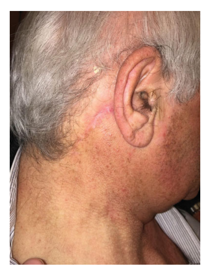
Fig. 3 Aesthetic result after 1 month of follow-up

aesthetic impact if compared with the conventional lateralcervical approach, making scars invisible. In 2013, Tae et al. showed in their study the use of a retroauricular approach with the support of a robotic device compared with conventional neck dissection, showing the overlap of the two techniques in terms of results obtained (on an oncological, functional and aesthetic level).<sup>13</sup> In 2014, Greer Albergotti