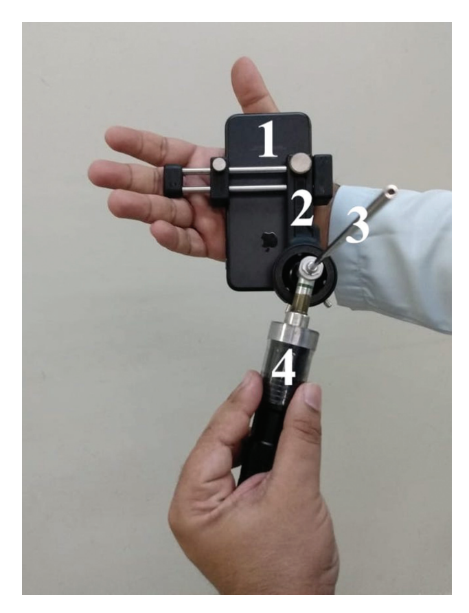
Fig. 1 Set of equipment consisting of 1) a smartphone; 2) an adaptor; 3) a telescope and 4) a light source.

The set of equipment used for the endoscopic procedures consisted of: 1) A Hopkins-type telescope of 4 mm in diame-