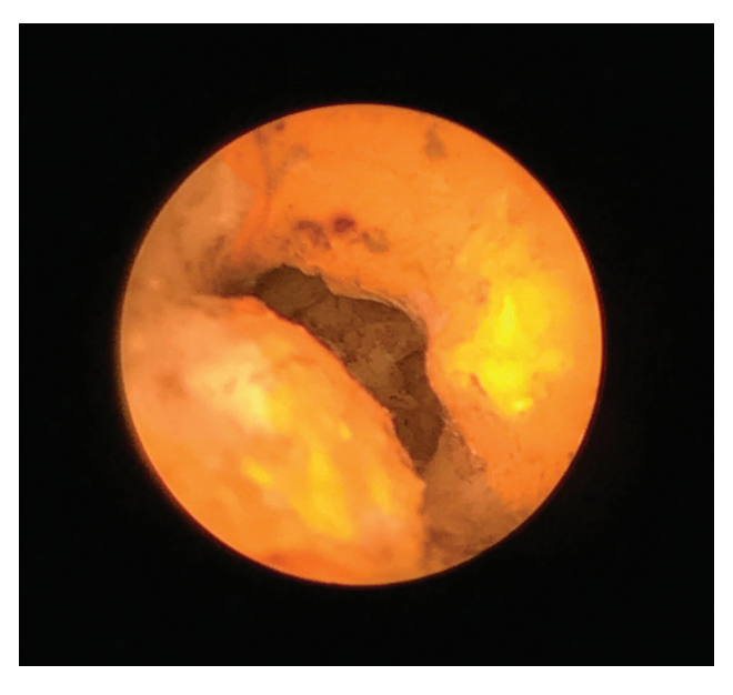
Fig.4 Left dry temporal bone: exostosis with blockage of the external acoustic meatus (anatomical specimen covered with yellow paint).

13/45 specimens (28.8%), with 12/45 (26.6%) consisting of stapes, all located in the oval window region ( \succ Fig. 5 ). The remaining case (1/45; 2.2%) consisted of an incus, situated on the floor of the ME. An open and protruding facial canal was found in 15/45 (33.3%) and in 7/45 (15.5%) of the specimens, respectively. The pyramidal eminence, the bony portion of the Eustachian tube, the semicanal of the tensor tympani