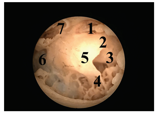
Fig. 5 Middle ear in a left dry temporal bone: 1) stapes; 2) subiculum; 3) fustis; 4) finiculus; 5) promontory; 6) Eustachian tube; 7) semicanal of the tensor tympani muscle.