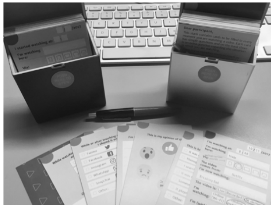
Figure 1 - Diary material and example of cards