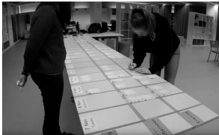
Figure 2 - Participant clustering cards during the interview

From 21 to 24 November 2017, ten semi-structured interviews were carried out with the participants, with an average duration of 49 minutes, totalling eight hours and 15 minutes of audio and video recordings. Each interview was divided in three stages. In the first, we worked with the participants on assembling a video watching calendar, in which they had to distribute their cards per day and time and afterwards cluster them by provider and screen with the use of post-its (Figure 2). They then quickly read the cards and identified them with coloured stickers to indicate when they watched online ( versus offline) and alone ( versus in company). During this process, which lasted for about 25 minutes (the timing varied based on the amount of cards), we interviewed the participants about the cards placed on the table or about the lack of cards in a certain period.