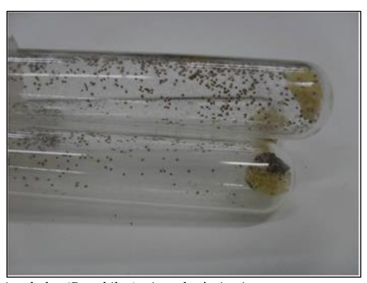
Figure 2. Larvae of Rhipicephalus (Boophilus) microplus in in vitro tests.

All the treatments were performed in triplicate and the results were obtained through their averages. The data obtained during the in vitro test was used to calculate the Reproductive Efficiency (ER) and the Efficiency of Treatment (ET), using the following formulas, described by DRUMMOND et al. (1973).