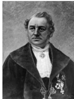
Figure 1. François Magendie – portrait by unknown artist (1822).

https://commons.wikimedia.org/wiki/File:Fran%C3%A7ois_Magendie.jpg