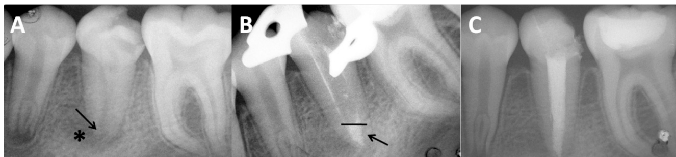
Fig. 3. Case 3. (A) tooth 35 presenting open apex (arrow) and extensive radiolucent area; (B) MTA apical plug (arrow); (C) reduction of periapical radiolucence after the period of 1 year.