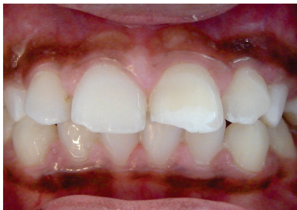
Fig. 5. Clinical examination 6 years after trauma occurrence.