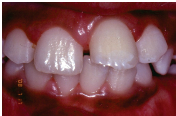
Fig. 4. Clinical examination showing complete eruption of the central incisors.

In the 46-month follow-up (May 2007), despite a slight change in normal position, the crown fully erupted (Fig. 4). Figures 5 and 6 shows the patient six years after trauma occurrence (December 2009) with dilacerated tooth maintenance. The patient had small enamel fractures in the central upper right and left permanent incisors. There was no esthetic complaint from the family, so repair will be carried out as soon as occlusion is established.