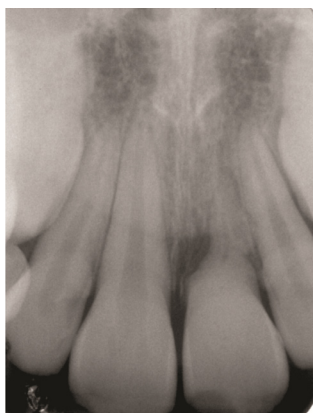
Fig. 6. Radiographic examination 6 years after trauma occurrence.