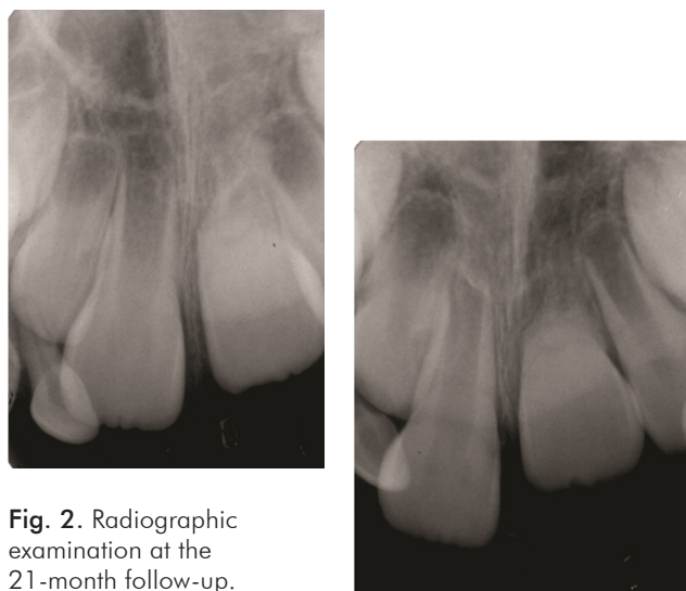
Fig. 2. Radiographic examination at the 21-month follow-up.