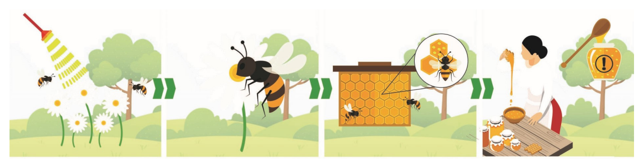
Figure 1. Honeybee exposure to pesticides and arrival of agrochemical residues in honey. Honeybees mostly perform pollination from plants linked to agrochemical processes for pest control. The pesticide is introduced into the animal's metabolism by dermal contact and/or ingestion of the plant products. Within all the metabolic processes of the bee residues of pesticides (direct or biotransformed) to bee products such as honey, there is a concern about the components of this matrix. Modified from Crenna et al. (2020).

The direct interaction of bees and nectar of pollinated plants is the source of the arrival of pesticides to honey since many of them are found in crops that receive agrochemical treatment with these compounds. Although the bee is the agent directly affected, many of these pesticides through their transformation or their residues can accumulate in honey and other bee products, as shown in Figure 1 (Belsky & Joshi, 2020; Vargas-Valero et al., 2020). Pesticides found in honey are considered persistent organic pollutants (POPs), which can persist in the environment through bioaccumulation in different matrices and biomagnifies in ecosystems, and have properties of chronic toxicity, one of their main compounds being lindane (Wang et al., 2019). Some of these POPs are classificated as "commonly used pesticides (CUP)", which are more water-soluble, less persistent, and less bioaccumulative than other POPs, including organophosphates such as chlorpyrifos (Adeyinka et al., 2022). However, their massive use and extensive amounts represent a critical hazard for those organisms that interact with the matrices containing the product, due to their carcinogenic, neurotoxic, adverse growth, endocrine disruption, or respiratory effects (Degrendele et al., 2022; Villalba et al., 2020).