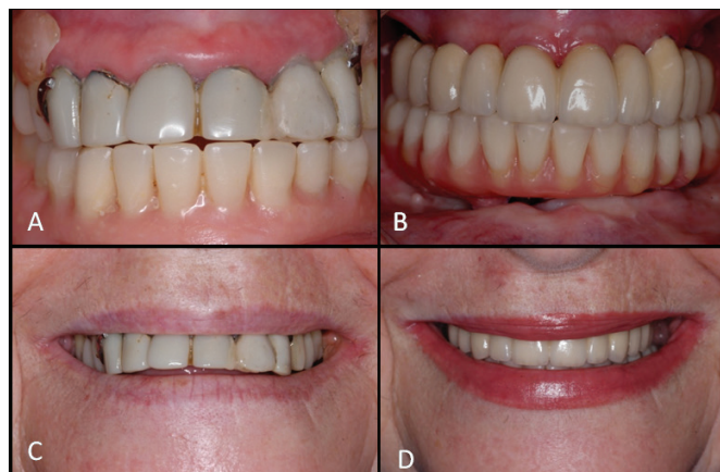
Figure 5. (A) Front view of the initial case; (B) Front view of final case; (C) Patient's smile at the beginning of treatment; (D) Patient's smile at the end of treatment.

The patient signed a Term of Free and Informed Consent, authorizing the publication of this study.