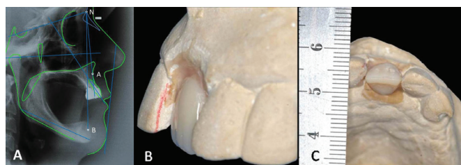
Figure 1. (A) Cephalometry with Steiner tracer. (B) Side view of new position of maxillary central incisor. (C) Occlusal view of new position of maxillary central incisor.

To determine the correct positioning of the new maxillary teeth, the Steiner cephalometric tracing technique (Figure 1) was used to position the maxillary central incisor during the diagnostic wax-up, since the teeth present were vestibularized and did not serve as a functional and esthetic reference.