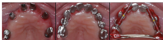
Figure 4. (A) Customized and cast UCLA type abutments in position; (B) Occlusal view of the metal infrastructure of the sectioned metal ceramic denture; (C) Performing intraoral welding.

The mandibular denture and the maxillary cast abutments were screw-retained with a torque of 24 N/cm, and access to the screw was filled with gutta-percha (Dentsply, Petrópolis, Brazil). The metal ceramic denture was put into place and after the due esthetic and occlusal adjustments, was finished and polished and then cemented with temporary cement (Rely X Temp NE; 3M Espe, St. Paul, MN, USA).