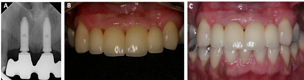
Figure 6. A) Radiograph of the structure test in zirconia; B) Installed prosthesis; C) Follow-up at 4 months.