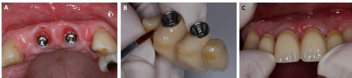
Figure 3. A) Beginning of the emergence profile; B) Addition of self-polymerizing resin; C) Tissue ischemia.

next visit, 48 hours later, papillae could already be seen to have formed with a satisfactory emergence profile. Further conditioning was performed over 3 or 4 more sessions in order to obtain contours in the area of the dummy teeth. A quantity of 1 mm of the same acrylic resin was added to the cervical region of elements 12/11/21/22, there was a wait while it set and then the temporary crown was moved into position, causing a compression of the area so that it would provoke a slight gingival ischemia. The temporary crown was held in position until the ischemia disappeared, approximately 2 minutes later (Figure 3C).