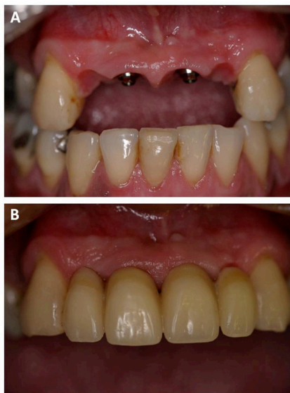
Figure 4. A) Papilla formation; B) Conclusion of conditioning.

This routine was repeated once a month until the gum was in the desired location and papilla formation was complete, in total approximately five months (Figures 4A and 4B).