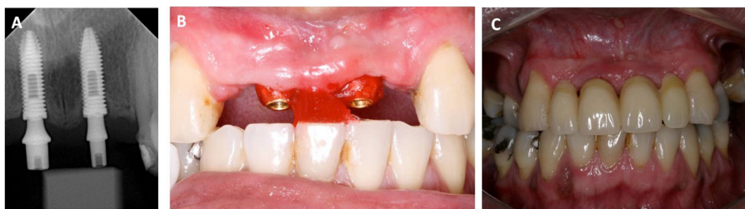
Figure 2. A) Choice of components; B) Interocclusal recording; C) Installation of the temporary crowns.

The prosthetist was instructed to create the temporary crowns with a neck height compatible with the canine neck height. As there was a lot of gingival tissue and the implants were located in a palatine position (position for a screwed prosthesis), it was deemed there was a need for conditioning so that the contour of the necks of the teeth could have a natural emergence profile. It was also deemed appropriate for the conditioning to be carried out in stages, as it would not be possible to obtain the desired format without harming tissue health. Accordingly, a neck format at the ideal height and an initial concave bridge format were requested to protect the tissue from excess pressure (Figure 2C).