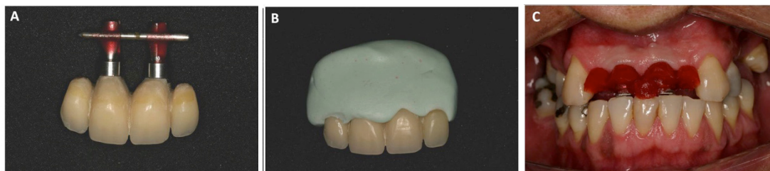
Figure 5. A and B) Copy of the emergence profile of the temporary crowns; C) Customized transfer components in place for the molding with interocclusal recording.

was deemed necessary to obtain a model that would provide its image on the laboratory bench so that the final prosthetic device could be obtained with the same favorable contours as the gingival tissue established in the temporary prosthesis. In order to obtain these models, the temporary prosthesis was removed and analogs were screwed on to it. Using heavy silicone (Speedex, Coltène, Altstätten, SG, Switzerland) the cervical portion of the temporary prosthesis was molded (Figure 5A). The temporary prostheses were removed keeping the analogs in place, thereby obtaining a mold of the cervical area of the temporary devices. The transfer dies were then screwed on to the analogs and red, inlay pattern resin (Duralay, Reliance Dental Mfg. Co., Worth, IL, USA) was poured on to this wall. In this way, a faithful copy of the position of the soft tissue was obtained after conditioning. These customized transfer dies were adapted to the mouth, bonded and then with short screws the interocclusal recording was performed. The screws were then once again replaced with long screws and the molding was performed with silicone (Speedex, Coltène, Altstätten, SG, Switzerland) (Figure 5B).