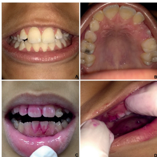
Figure 1. Oral cavity clinical aspects. A, B: Presence of dental plaque and carious lesions. B, C: Presence of plaque evidence in the anterior and posterior teeth.

Of the total of children evaluated, 57.7% had active tooth decay, and the DMFT index found was 1.80 ( \pm 1.93 ) (table 1). The initial IHOS index obtained an overall average of 1.85 ( \pm 0.53 ); and the final IHOS, 0.92 ( \pm 0.50 ) (figure 2). In relation to oral hygiene habits, 73.07% reported brushing over 2 times a day and only 50% of the students evaluated did not use dental floss.