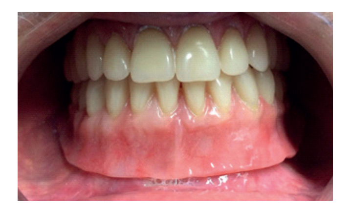
Figure 5. Installed overdenture prostheses.

conditions, mandibular overdenture adaptation and retention showed satisfactory results clinically analyzed and reported by the patient during the 6-months follow up.