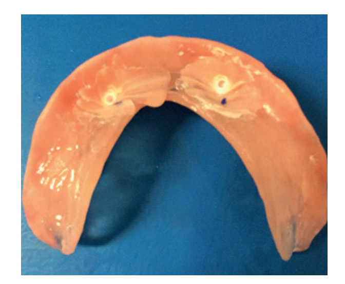
Figure 3. Teflon capsules captured.

The conventional capsules were removed with a frusto-conical cutter (figure 1) and the Teflon® capsules (Fig. 2 and 3) were fixed with autopolymerizable acrylic resin (Clássico, Campo Limpo Paulista, SP, Brazil). After polymerization was performed the finished, polished (Fig. 4), and installed the prostheses (Fig. 5). Soft tissues