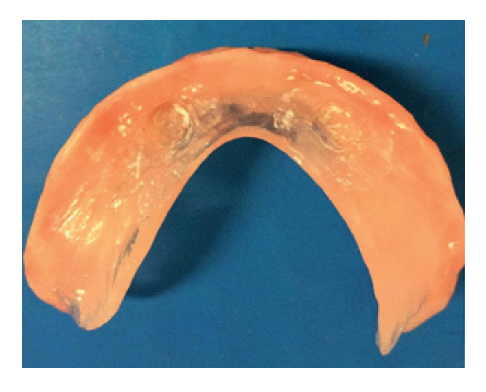
Figure 1. Overdenture prepared for capture of capsules.

After installation of the new prostheses, the patient returned to the clinic complaining of lack of retention of the inferior overdenture. Clinical examination revealed O-ring wear, instability of the prosthesis, and difficulty with insertion. Then was suggested to replace the conventional capsule with O-ring with an alternative model, made of polymeric material, Teflon<sup>®</sup>, with dimensions of Ø 4 x 3 mm.