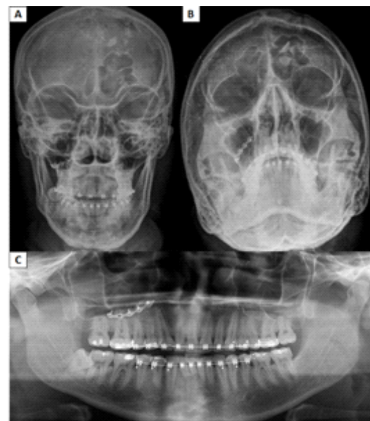
Figure 3. Anteroposterior radiograph of skull (face) showing the positioned plate and radiolucent right maxillary sinus (A); Waters view radiograph of the face at day 30 postoperatively (B); Panoramic radiograph showing the positioning of the plate and radiolucent maxillary sinus (C).