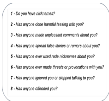
Chart 1. Questions used to assess the history of bullying.

received a binomial classification. The responses were added and the adolescents were classified according to the median, between this with and those without bullying (chart 1).