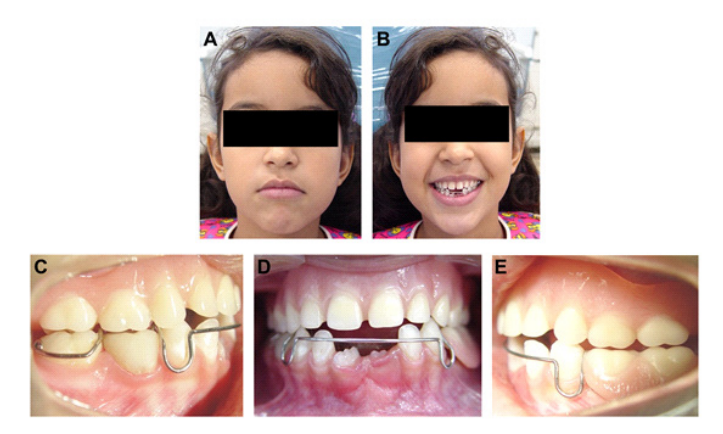
Figure 3. Final appearance of functional rehabilitation: maxillary total and mandibular removable partial dental prosthesis. Right-, frontaland and left- view after treatment and adaptation of dental prosthesis.