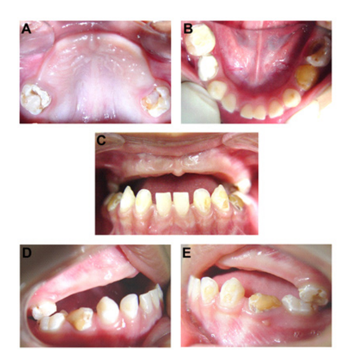
Figure 1. Pretreatment maxillary and mandibular-occlusal primary dentition views of a 5-year-old child with ECC (a). Multiple premature tooth loss (b). Presence of unsatisfactory restorations and coronary destruction (c). Frontal occlusal view (d and e) Right and left lateral occlusal views.

Extra-oral examination, including inspection of head, neck, and surrounding structures, was performed with no significant findings. Intra-oral examination (dental and occlusal analyses) revealed primary dentition, white spot lesions on the buccal surfaces of lower right lateral incisor and canine, severe premature tooth loss due to dental caries and trauma, and deficient resins' and glassionomer cements' restorations on the upper second molars (figure 1). Additionally, a fistula was detected at the apical region of the first mandibular molar (figure 1E). Occlusal