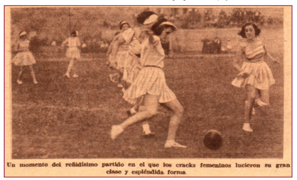
Picture 4 - Female Choreographic Football: [caption: A moment from the tight game where the girl cracks flaunted their class and gorgeous shape]

RUSH, 1934, no. 41, p. 2. Portal Anáforas archive.