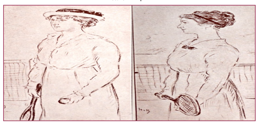
ANALES MUNDANOS, 1915, no. 3, p. 26.

As shown by Pictures 1 and 2, the clothing worn by women was certainly not chosen because of its comfort to play tennis, as this 'uniform' would clearly limit their movements, as opposed to Picture 3, showing well-known US tennis player Hellen Wills, which illustrated an article on international tennis published by Deportes in 1930.