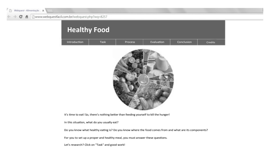
Figure 1- WebQuest Homepage. Porto Alegre, 2017

The stages of the WebQuest were the 'introduction', with brief text presenting the objectives of the activity and encouraging the students to take interest in the theme. In the second stage, called 'task', it was presented what a blog was and the proposal of elaboration of it. The opening page of the WebQuest with the structure of the steps to be performed by the students is presented in Figure 1.